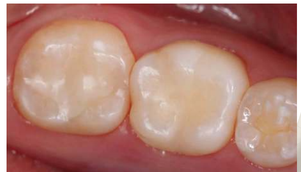
CLASS I DIRECT RESTORATION WITH BULK EZ