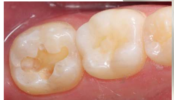
CLASS I PREPARED CAVITY